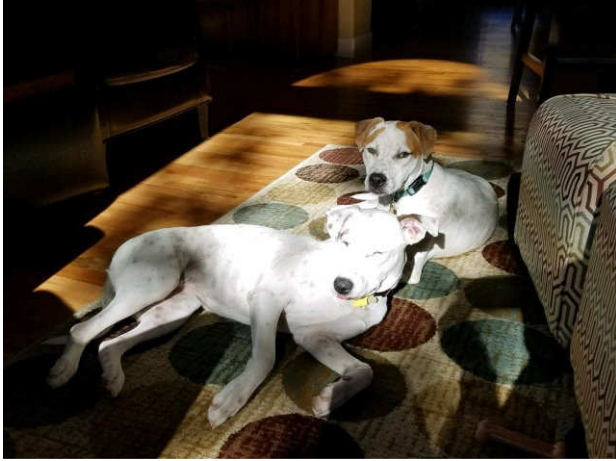
They like hanging out in the sun taking a nap