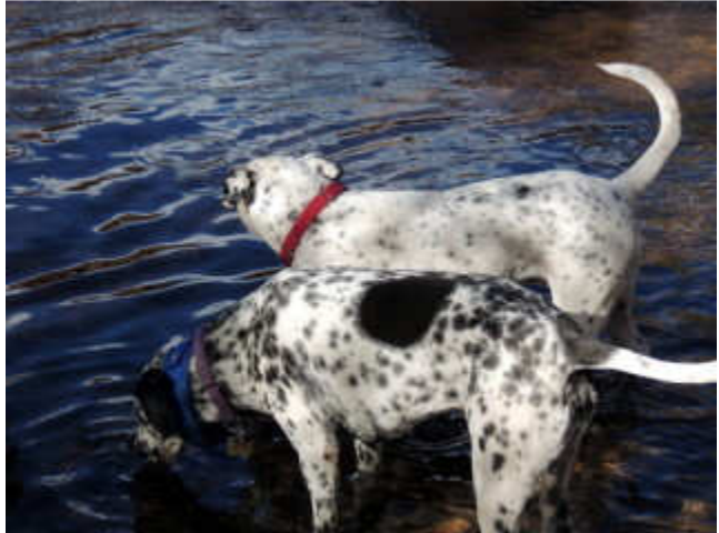
Stopping for a quick drink and splash