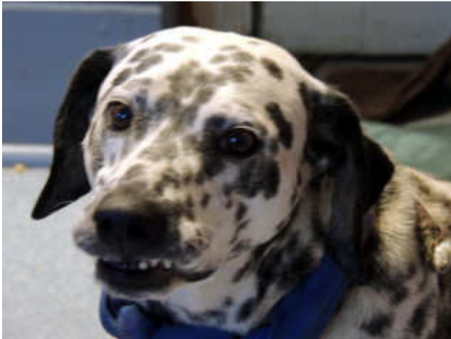
Josie's special smile