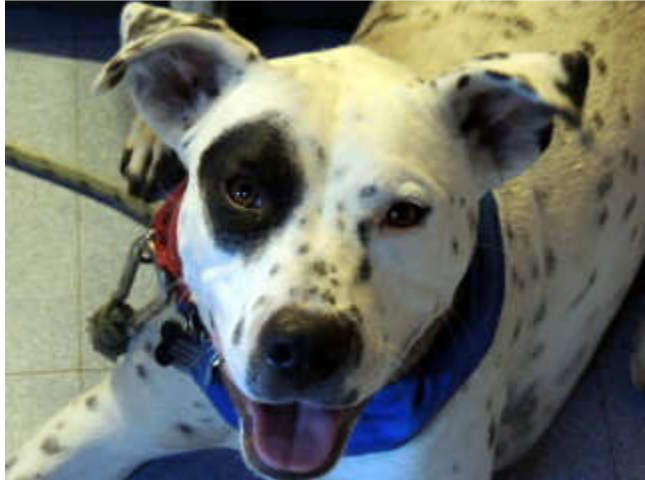
Olive poses for a close up!