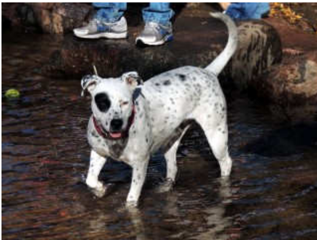
Olive takes a quick dip in the water during a walk.