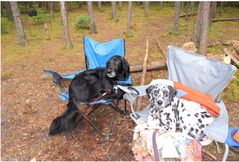
Sitting by the fire with brother Sisco.