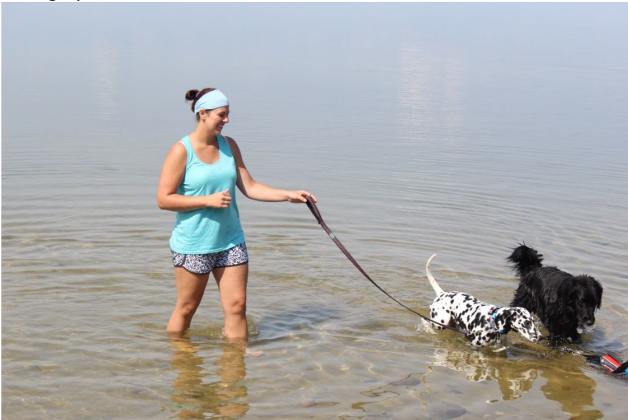
First time at the lake and she loved the water!