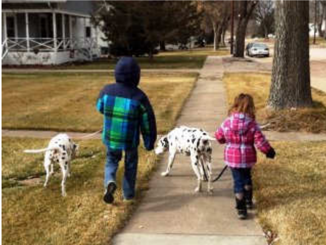
Blue and Belle take the kids for a walk!