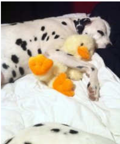
Taking a nap with favorite ducky