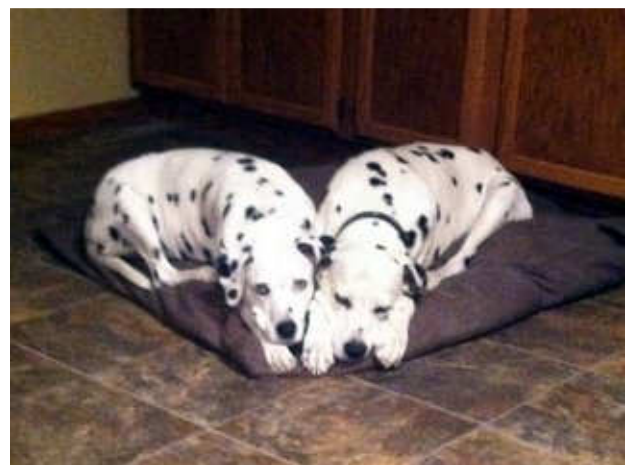
Bed Time for the kids