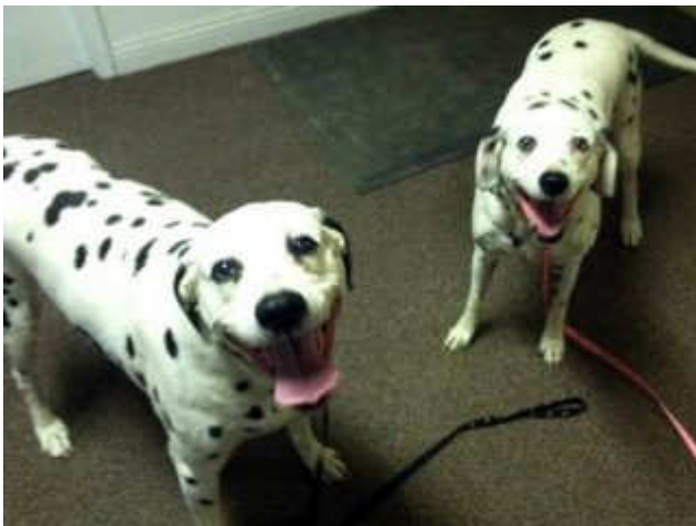
Blue and Belle getting mail at the post office