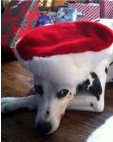
Belle guards the gifts.