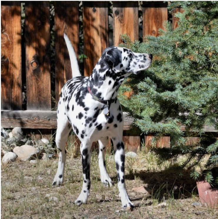
Trooper looking for grasshoppers.