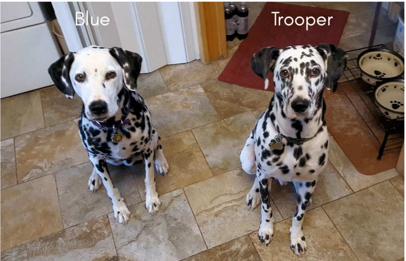
"Seriously. Is It Dinnertime yet?"