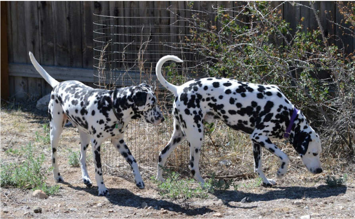
Trooper follows Blue around his new backyard.