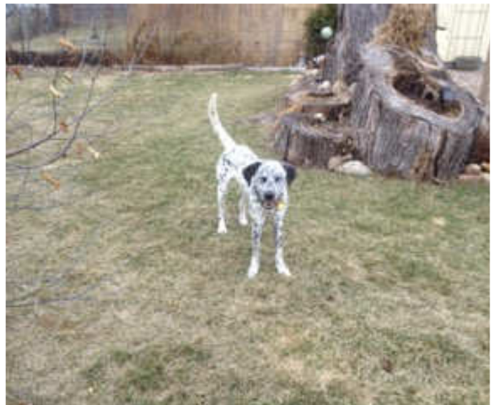
Check out the climbing tree in my new back yard!!!