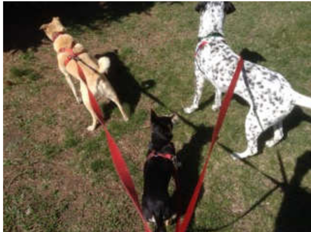
Where's that killer squirrel? I know he's around here...