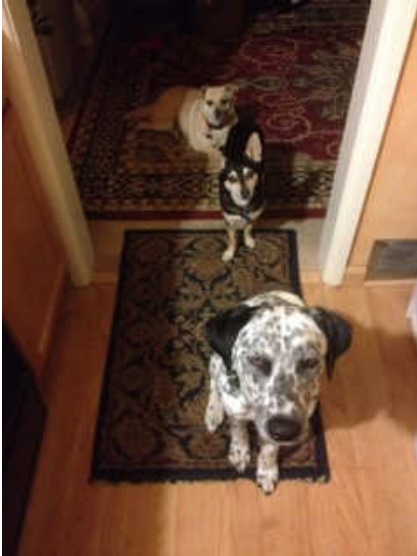
My new brothers let me line up first for dinner! Aren't they great brothers?