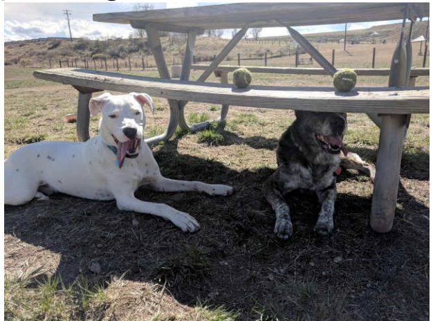
Tuckered out after playing ball. Time for a break!!