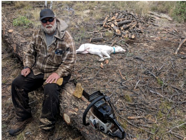
It's tiring work to supervise all this wood cutting!