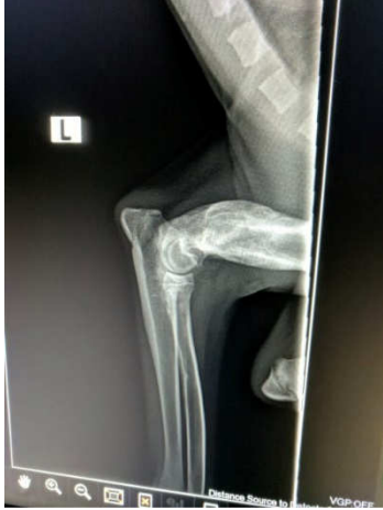
This is my leg when it got broken!