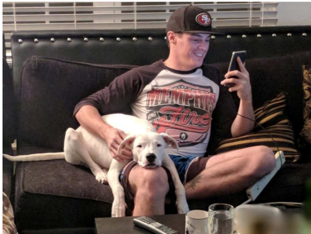
Chillin' with my friend... he makes a great pillow.