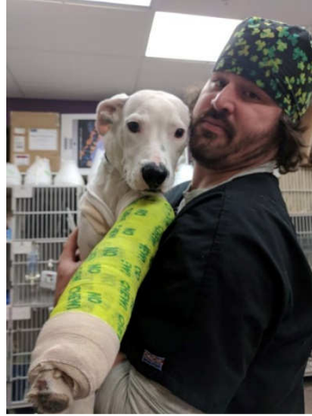
Stylin' in my green cast. 😊