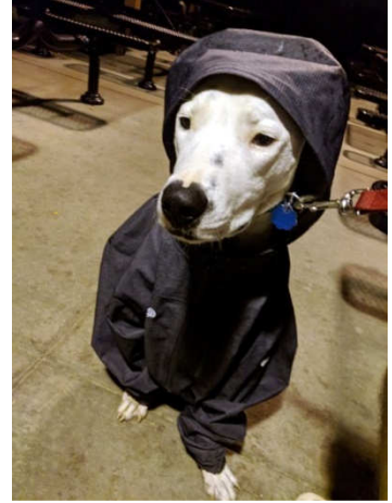
Do you like my new raincoat?