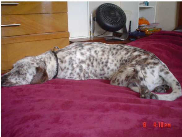
Mojo napping on his Mom & Dad's bed