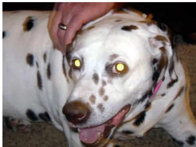
Hanging out getting my ears scratched